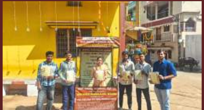
CHILD RIGHTS AWARENESS THROUGH KIOSK