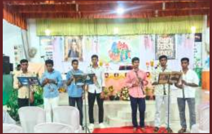
FOUNDER'S DAY CELEBRATION