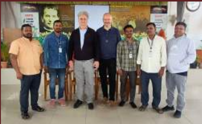
VISIT BY ECONOMER GENERAL