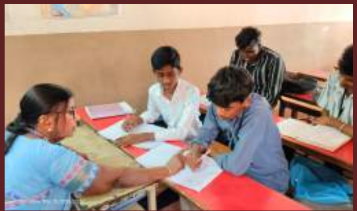
BASIC LITERACY THROUGH BRIDGE CLASS