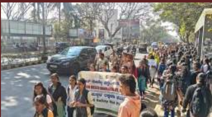
RALLY AGAINST CHILD MARRIAGE