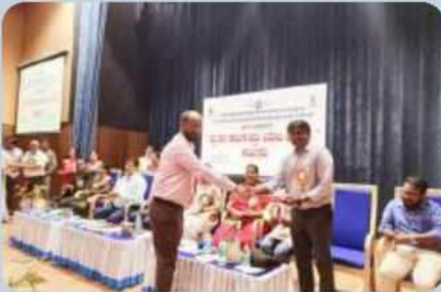
World Day Against Child Labour Programme and Street Play