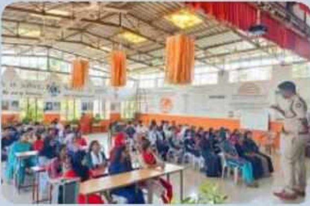
Fire and Safety Awareness