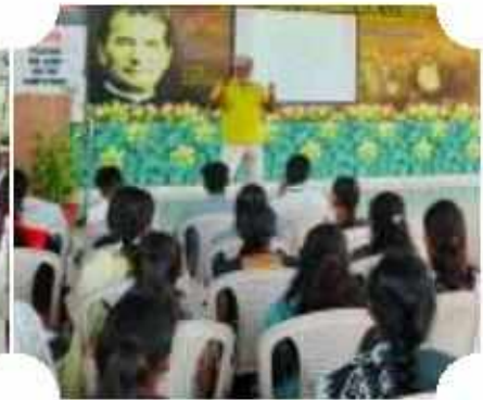
CREATIVITY AND INNOVATION

We host a variety of workshops and seminars on topics such as conflict resolution, soft skills, fire and safety awareness, first aid, health and hygiene, self-defence, yoga, time management, and artistic skills to give the youngsters with additional essential information. The resource persons, who are experts in their fields, enrich the youth with their knowledge and insights, inspiring them to become better leaders and team players when they join reputable companies.