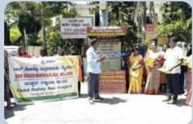
Inauguration of Child Rights Kiosk