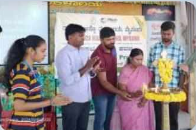
Inauguration of Child Safety Net Project