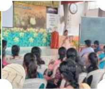
HEALTH AND FIRST AID