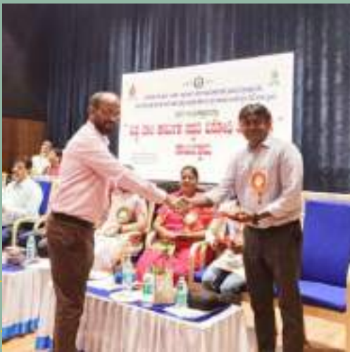
World Day Against Child Labour programme conducted by the Labour department at Builders Association, Vishveshwaranagar, Mysore