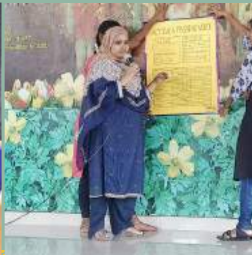
Spoken English Activity