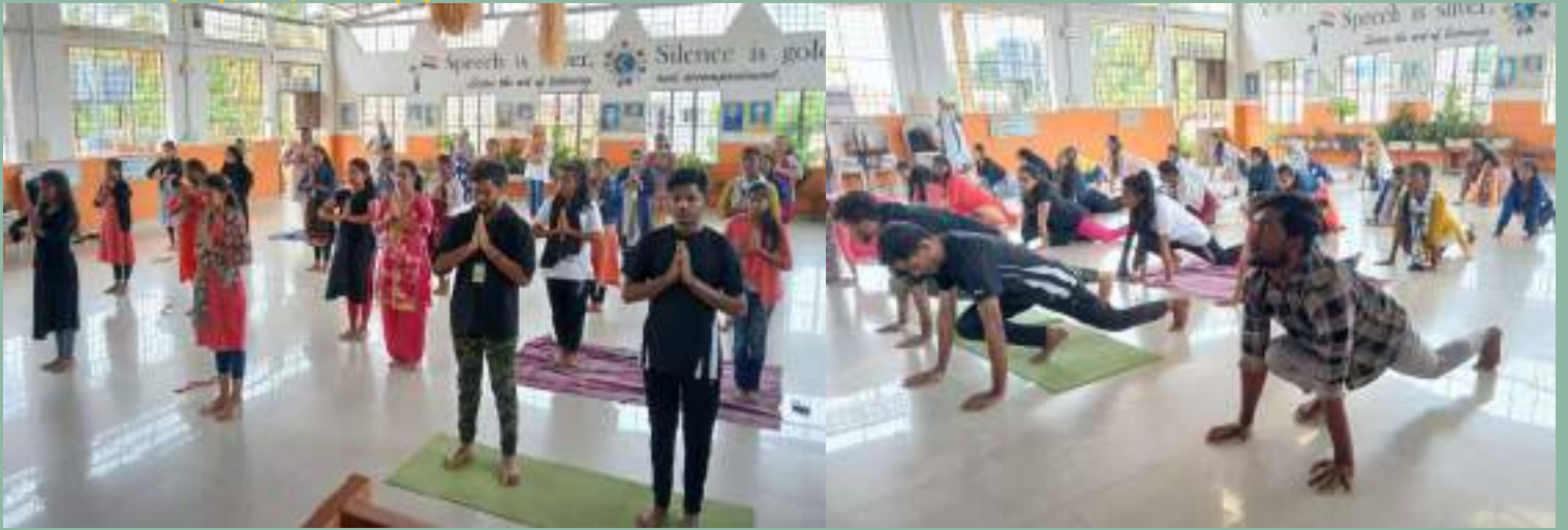
Workshop on Yoga conducted at Don Bosco Makkalalaya to celebrate The International Day of Yoga