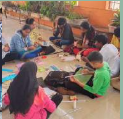
Life Skills Activity for Summer Camp