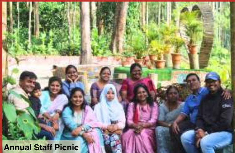
Annual Staff Picnic