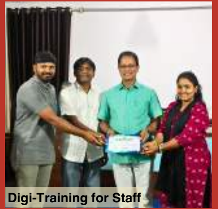
Digi-Training for Staff