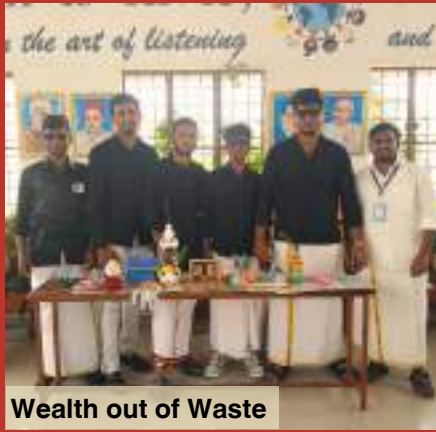
Wealth out of Waste